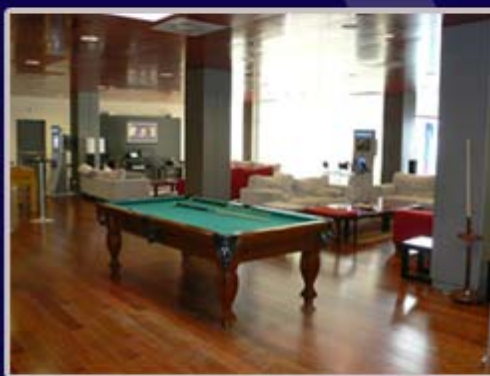
Hotel Lobby, TV, and game room area.